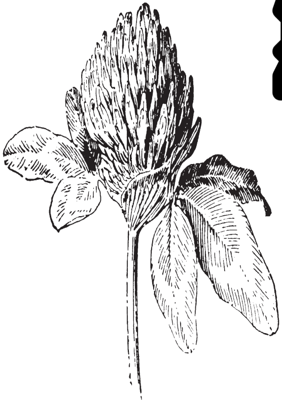
State Flower red clover